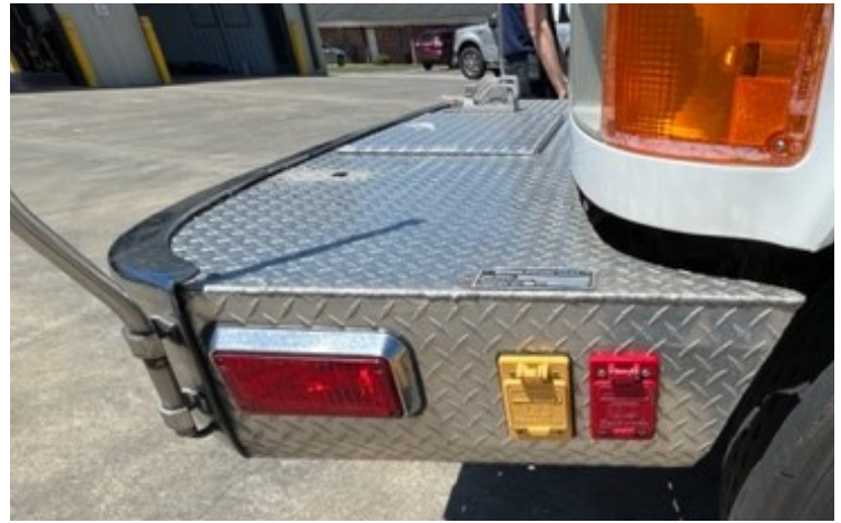
Whelen Warning Light with Kussmaul Auto – Eject 110 V inlet ad Kussmaul Auto-Air Eject