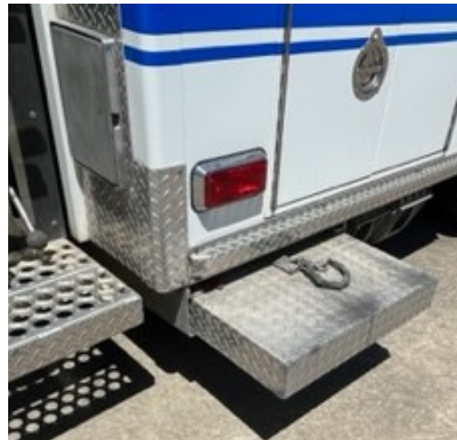
Slide Out Float for Suction Hose Strainer