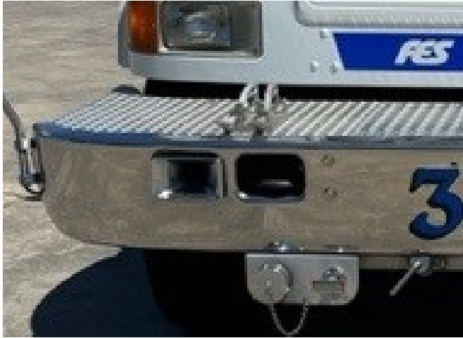
2.5" Front Bumper Discharge with Control Under Front Bumper