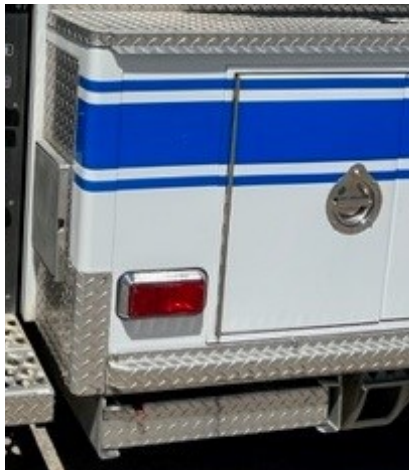
Slide Out Float in Stored Position